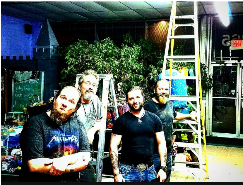
Members of TSC complete their Shine On lighting project at Mystic Moon.